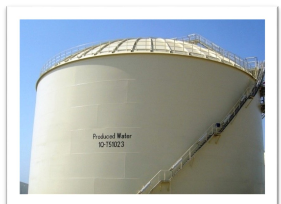
A produced water storage tank

While it is important to treat for all of these impurities, salts are the biggest challenge.5 Produced water can be 1-30% salt by weight (compare that to seawater at 0.3%)!6 At such high salinity levels, standard wastewater treatment methods cannot be used.7 Existing methods of desalination, the process of removing salt from the water, are very costly and require a lot of energy. Current research is pursuing a solution to this matter.