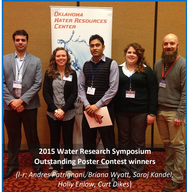
2015 Water Research Symposium Outstanding Poster Contest winners

Students and professionals presented their posters in a Cafe-Style session. Five students were recognized for their Outstanding Poster Presentation .