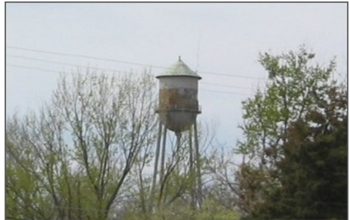
Elevated water tower in Beggs, OK

grants and people who could help them apply for funds for these projects, to implement some of the suggested improvements."