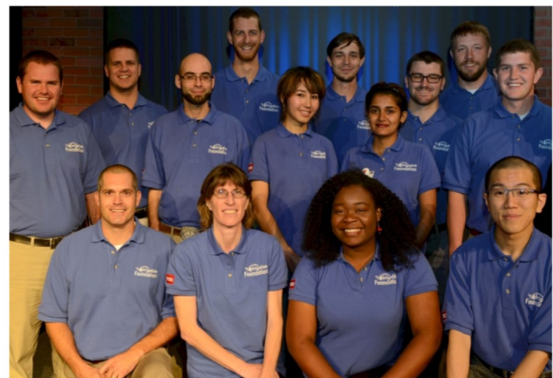
OSU Students Win Irrigation Foundation Awards