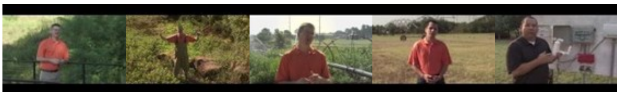
Intro to the Oklahoma Water Resources Center